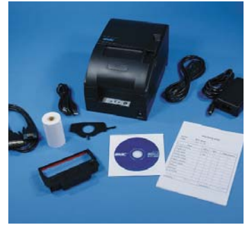
Includes Everything Necessary in the Carton