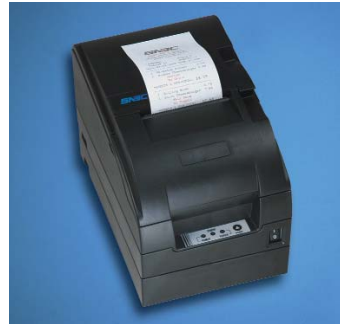
Conceal the Power Supply in the Optional Power Supply Cover