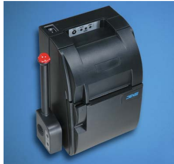
Built-In Wall Mount Capability and Optional Audio/Visual Print Messenger